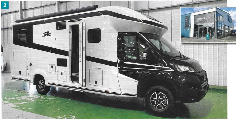
2 Laika Kreos L 5009 raised by the M-level system fitted at Camper UK